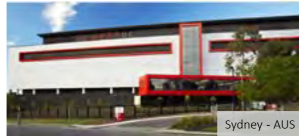
Sydney - AUS

So far the Sydney, Canberra, Melbourne and Perth facilities have been successfully commissioned with the Fike ProInert system. With the S1 (Sydney) facility boasting the biggest inert gaseous extinguishing system in Australia with over 600+ (300bar) ProInert cylinders installed.