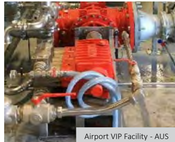
Airport VIP Facility - AUS