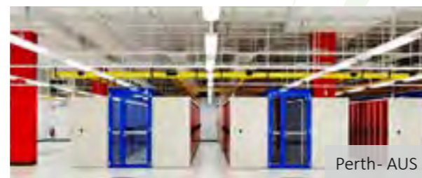
Perth - AUS