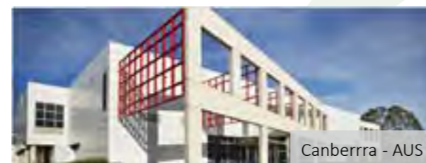
Canberra - AUS

PROJECT: JOINT STRIKE FIGHTER FACILITY CLIENT: TRIPLE M FIRE SITE: RAAF WILLIAMTOWN PRODUCT: FIREDOS BRIEF SCOPE: Design, supply foam propylene system to support three (3) hanger applications