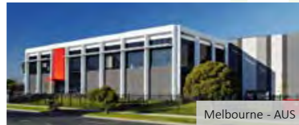
Melbourne - AUS