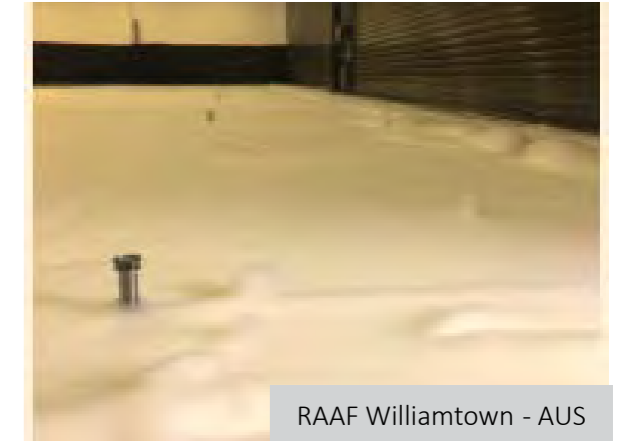
RAAF Williamtown - AUS

PROJECT: JOINT STRIKE FIGHTER FACILITY CLIENT: TRIPLE M FIRE SITE: RAAF WILLIAMTOWN PRODUCT: FIREDOS BRIEF SCOPE: Design, supply foam propylene system to support three (3) hanger applications