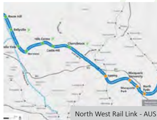
North West Rail Link - AUS

PROJECT: NORTH WEST RAIL LINK CLIENT: NORTHWEST RAPID TRANSIT | SYSTEM JOINT VENTURE SITE: SYDNEY NORTHER SUBURBS PRODUCT: PROINERT (IG-55) GASEOUS SUPPRESSION