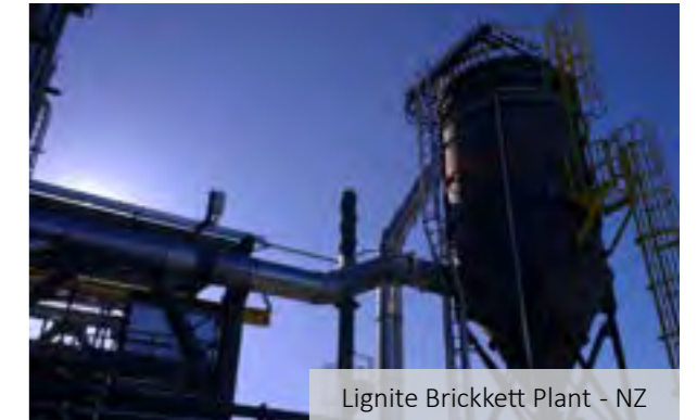
Lignite Brickett Plant - NZ

BRIEF SCOPE: Design, supply and project management of an Industrial Explosion Suppression System to protect Hammer Mills, Surge Bins and Hoppers.