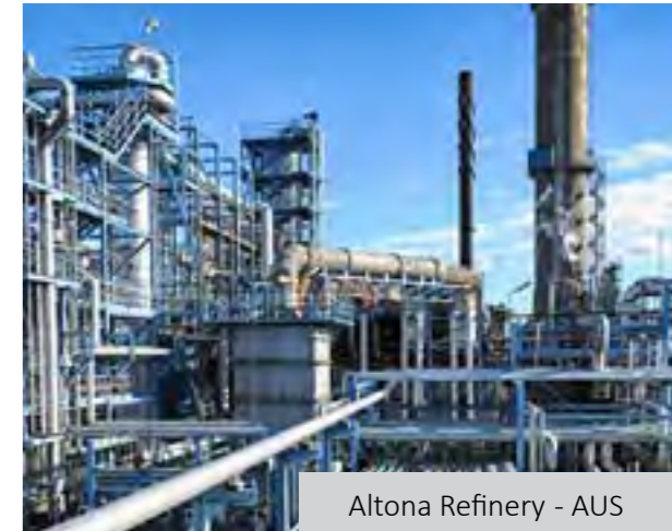
Altona Refinery - AUS

BRIEF SCOPE: Fire Protection Technologies were engaged to assist Exxon Mobil them in designing and to providing a New Generation Fire Fighting Foam systems that are to be used to protect Terminals and Refineries across Australia and New Zealand. A critical element of the decision to use the FireDos Foam Proportioning System in these applications was the system's ability to accurately proportion pseudoplastic fluorine free foam and the unique ability to test the accuracy of the proportioning system without the need to discharge a drop of foam or generate any foam solution.