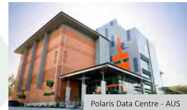
Polaris Data Centre - AUS

PROJECT: POLARIS DATA CENTRE CLIENT: THIESS SITE: POLARIS DATA CENTRE SPRINGFIELD, QLD PRODUCT: PROINERT GASEOUS SUPPRESSION SYSTEM BRIEF SCOPE: Design & construct project, supplying design and project management works for a ProInert System for the Polaris Data Centre Springfield.