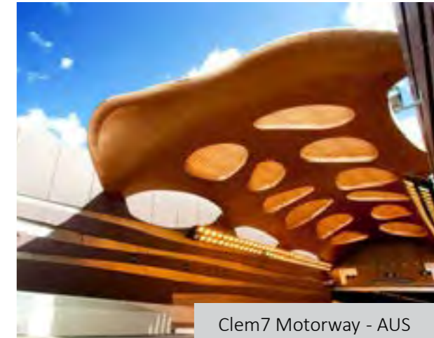
Clem7 Motorway - AUS

BRIEF SCOPE: Design & supply commission project, providing system design, hardware, installation support, configuration program and commissioning of Fibre Optical linear heat detection system. The system interfaced directly with the fire control panels to operate the appropriate sprinklers deluge system within the 4.5 Km long tunnel.