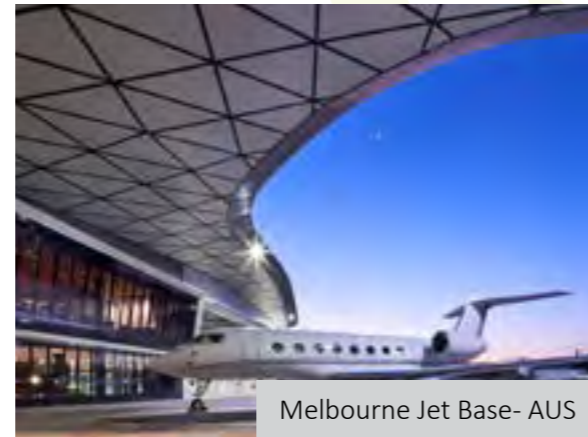
Melbourne Jet Base- AUS

BRIEF SCOPE: Fire Protection Technologies were engaged by Entire Fire Protection to design and supply a foam firefighting system to protect the Melbourne's VIP Jet Base main hangar. The system provided comprised of 3 FireDos foam Proportioning systems and included main and reserve 316 grade stainless steel firefighting foam storage tanks. The system is has been designed to achieve flow rate of up to 26,000 Litres per minute using parallel FireDOS FD1500/3-PP-S for the main hangar and flow rates up to 7,300 litres per minute using a single FireDOS FD10000/3-PP-S for the DC3 Hangar.