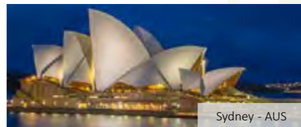
Sydney - AUS

BRIEF SCOPE: The VORTEX Hybrid Water Mist System was selected to protect the operation critical Winch Rooms with the iconic Sydney Opera House. The winch rooms are critical for the Sydney Opera House as they winch up stage props during performances. The system configuration is unique as the cylinder bank has been located in the basement of the building with combination panels arranged at various winch room locations. This hybrid water mist system has been configured in a similar method to a traditionally gaseous suppression selector valve system that shares a common bank of Inert Gas Cylinders. The combination panels are designed to divert the nitrogen and water to the specific risk that is entered into alarm from the logic of the fire detection system.