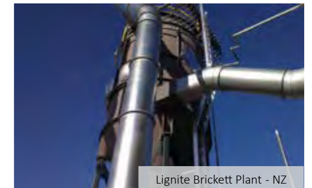
Lignite Brickett Plant - NZ

PROJECT: VICTORIA PARK TUNNEL SITE: AUCKLAND PRODUCT: MICRO CHIP LINEAR HEAT DETECTION SYSTEM & PROINERT GASEOUS SUPPRESSION SYSTEMS