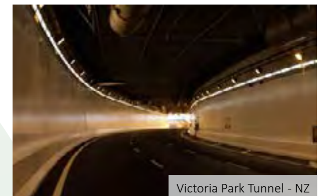
Victoria Park Tunnel - NZ

BRIEF SCOPE: Design, supply and commissioning of a Micro Chip based intelligent linear heat detection system for the Vic Park Tunnel and ProInert systems to protect critical Switch Rooms etc.