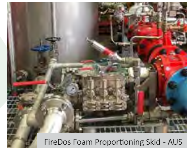
FireDos Foam Proportioning Skid - AUS