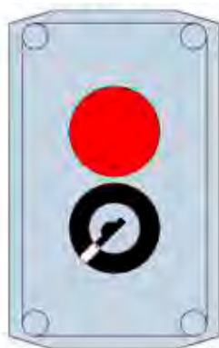
Maintenance Key switch