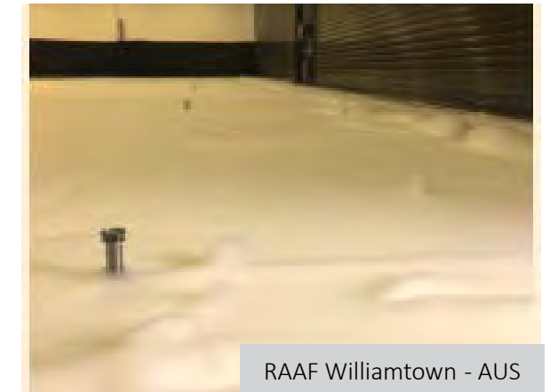
RAAF Williamtown - AUS

PROJECT: JOINT STRIKE FIGHTER FACILITY CLIENT: TRIPLE M FIRE SITE: RAAF WILLIAMTOWN PRODUCT: FIREDOS BRIEF SCOPE: Design, supply foam propylene system to support three (3) hanger applications