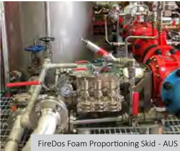
FireDos Foam Proportioning Skid - AUS