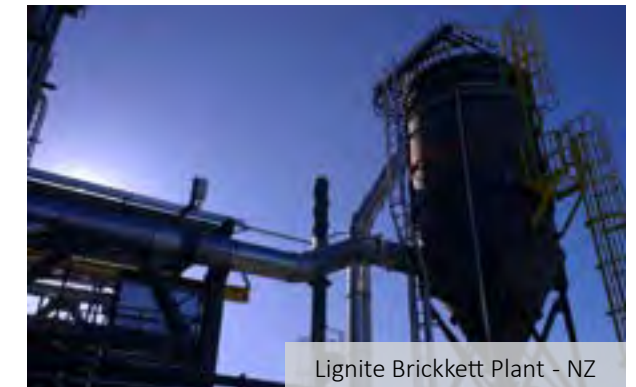
Lignite Brickett Plant - NZ

BRIEF SCOPE: Design, supply and project management of an Industrial Explosion Suppression System to protect Hammer Mills, Surge Bins and Hoppers.