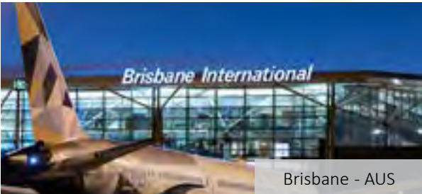
Brisbane - AUS

PROJECT: 7 WINCH ROOMS CLIENT: TRIPLE M FIRE PROTECTION SITE: SYDNEY OPERA HOUSE PRODUCT: VORTEX 1500