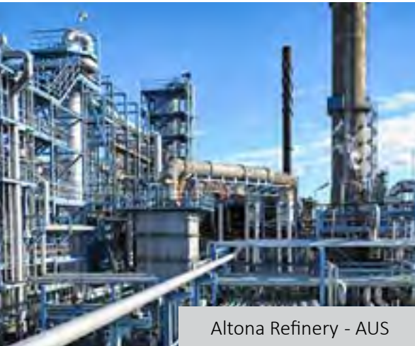
Altona Refinery - AUS

BRIEF SCOPE: Fire Protection Technologies were engaged to assist Exxon Mobil them in designing and to providing a New Generation Fire Fighting Foam systems that are to be used to protect Terminals and Refineries across Australia and New Zealand. A critical element of the decision to use the FireDos Foam Proportioning System in this these applications was the system's ability to accurately proportion pseudoplastic fluorine free foam and the unique ability to test the accuracy of the proportioning system without the need to discharge a drop of foam or generate any foam solution.