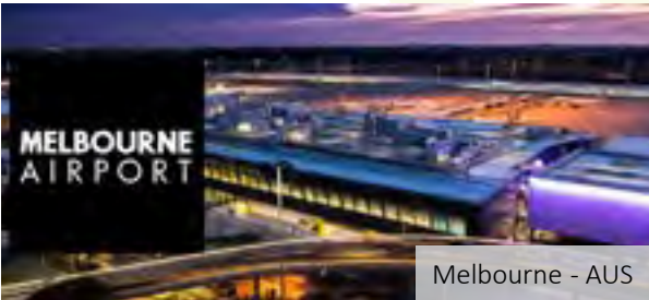
Melbourne - AUS

BRIEF SCOPE: New Air Services Communication Centre for monitoring Air Traffic around Australia. ProInert Gaseous Suppression was used in Communication Rooms, MSB Room and UPS Rooms. System configuration was a connected Main and Reserve cylinder bank, in the event of a system activation allow for immediate change over to the reserve system. The Fogtec High Pressure Water Mist System is protecting the Diesel Generator Rooms A & B. The unique Vortex Hybrid Water Mist System with its incredibly fine water droplet sizes is protecting the UPS Battery Rooms A & B.