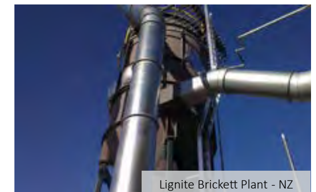
Lignite Brickett Plant - NZ

PROJECT: VICTORIA PARK TUNNEL SITE: AUCKLAND PRODUCT: MICRO CHIP LINEAR HEAT DETECTION SYSTEM & PROINERT GASEOUS SUPPRESSION SYSTEMS