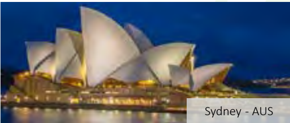
Sydney - AUS

BRIEF SCOPE: The VORTEX Hybrid Water Mist System was selected to protect the operation critical Winch Rooms with the iconic Sydney Opera House. The winch rooms are critical for the Sydney Opera House as they winch up stage props during performances. The system configuration is unique as the cylinder bank has been located in the basement of the building with combination panels arranged at various winch room locations. This hybrid water mist system has been configured in a similar method to a traditionally gaseous suppression selector valve system that shares a common bank of Inert Gas Cylinders. The combination panels are designed to divert the nitrogen and water to the specific risk that is has entered into alarm from the logic of the fire detection system.