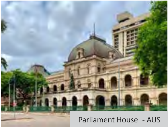
Parliament House - AUS

BRIEF SCOPE: ProInert (IG-541) Gaseous Suppression systems have been installed to protect the Brisbane Parliament House Strong Rooms whilst the Vortex Hybrid Water Systems is being used to protecting the Library areas.