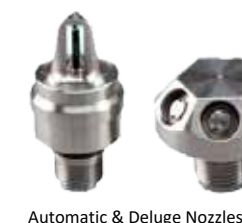
Automatic & Deluge Nozzles

away with conventional wet chemical systems and the potential messy clean-up process. The system complies with AS 4587 and is LPCB approved for specific kitchen exhaust hood applications.