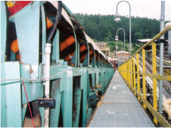
Protectowire Linear Heat Detector