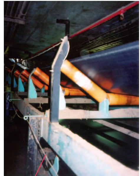
Protectowire Linear Heat Detector

Protectowire Linear Heat Detector is a component of a complete family of fire detection systems manufactured by The Protectowire Company.