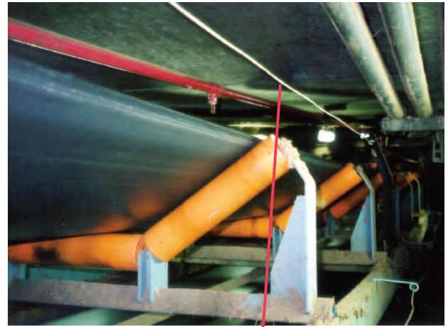
Protectowire Linear Heat Detector

On belt type conveyors, Protectowire Linear Heat Detector can be ceiling or pipe mounted, or installed on either side of the belt on or above the idler arms. Type XCR or EPR Detectors withstand abrasive coal dust, moisture and the corrosive atmosphere found in this environment.