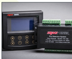
FR-4000 (4 zone)