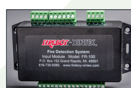
FR-100 Input Module