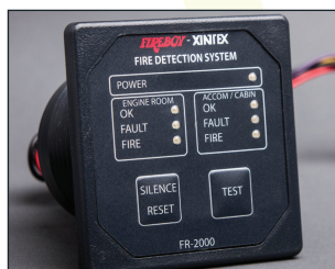
FR-2000 (2 zone)