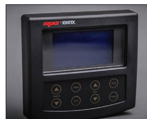
FR-8000 (8 zone)