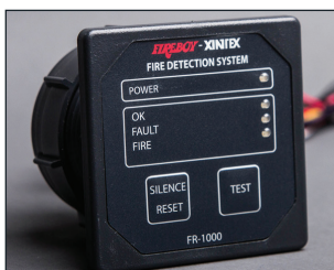
FR-1000 (1 zone)