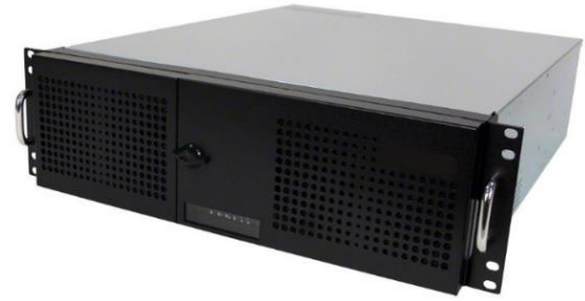
12 and 18 TB Server

Multiple Network Servers can be installed and accessed over a single IP network by one VMS workstation for easy scalability. This provides the ability to build an enterprise-level surveillance system with a large number of cameras that can be monitored and configured from a single VMS workstation.