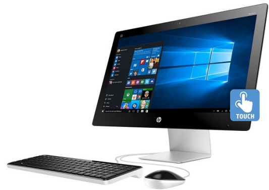
FSM-IP NVR Lite Workstation